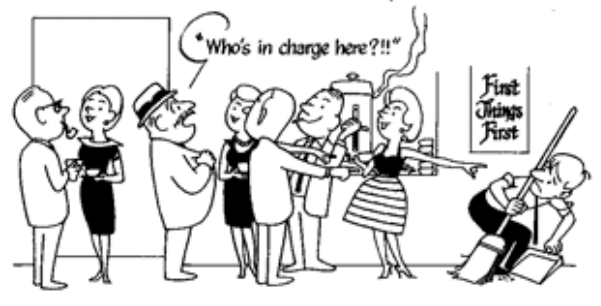
We are paid off in sobriety, respect and love.