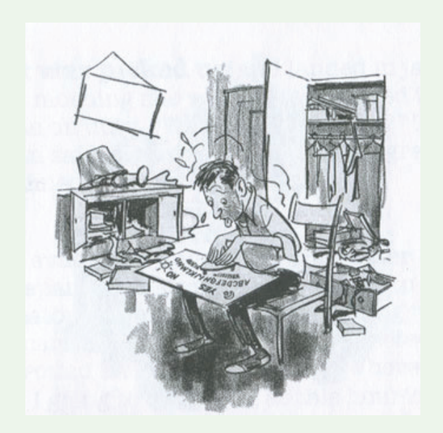
"Will you please just tell me this, is my bottle even in this room?"