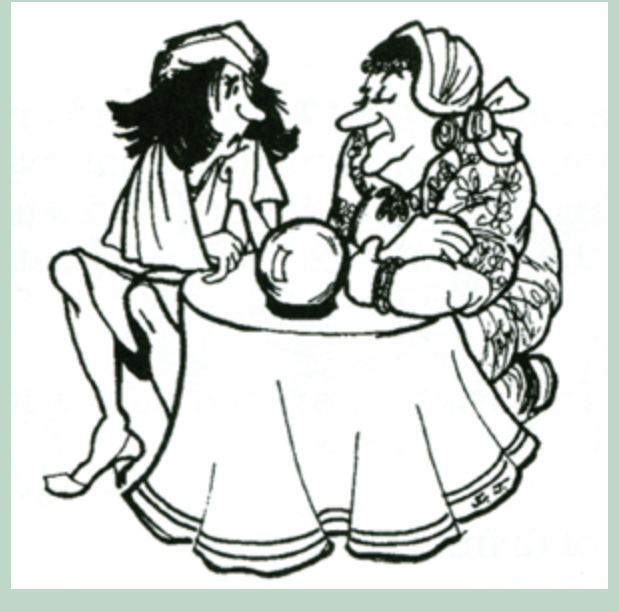
"Honey, I don't need a crystal ball to see that you are an alcoholic."