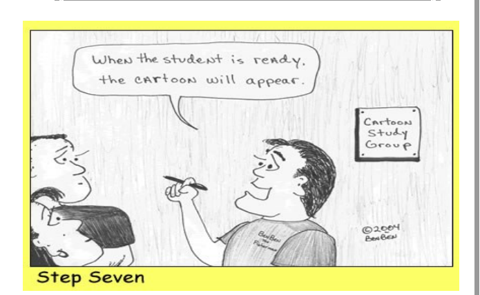
Permission: recoverycartoons.com BenBen