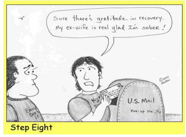
Permission: recoverycartoons.com BenBen

Humbly asked Him to remove our shortcomings.