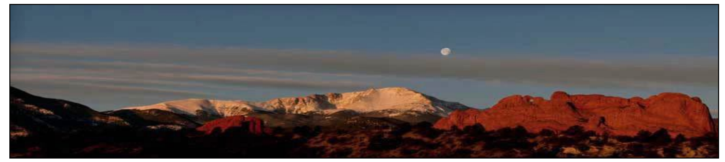
A Newsletter for the Pikes Peak Region of Alcoholics Anonymous