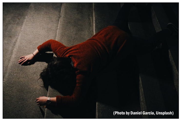
If there was a magic pill allowing you to drink with impunity, would you

In this sentence from The Doctor's Opinion I found that I chase the effect of alcohol: "They are restless, irritable and discontented, unless they can again expe-thinking. rience the sense of ease and comfort which comes at