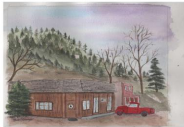
Red Cloud Serenity Club

10400 Ute Pass Ave Green Mountain Falls, CO (across from Lake/Gazebo) Please join us for a meeting!